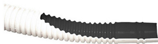
Tube section with double coating